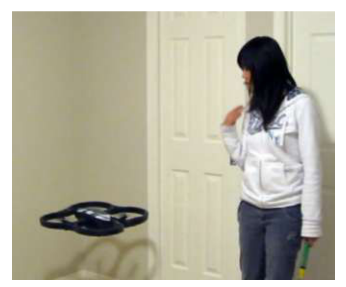
Figure 1. Using a gesture to indicate to a robotic drone to fly closer.

When a flying robot is far away from the user, a social disconnection is inevitable. However, when communicating