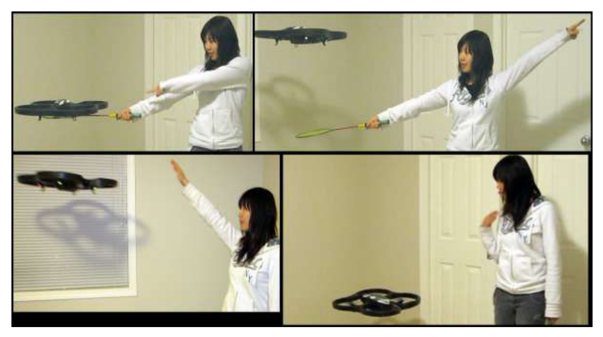
Figure 3. (Top) A user doing the takeoff gesture with a badminton racquet as the takeoff pad. (Bottom left) Making a raise gesture. (Bottom right) Making a come gesture.

In the following section, we outline a small set of basic tasks we selected to examine the validity of collocated gesturebased interaction with a flying robot, and to suggest a set of specific gestures that would allow the user to communicate these interactive tasks to the collocated flying robot. Ours is by far not a comprehensive list of tasks that can be done with a collocated flying robot, and are used only in order to illustrate and later evaluate the general approach we are proposing. These gestures (see Figure 2) are only meant to be used when the quadrotor is close to the user and when a line-of-sight can be maintained.