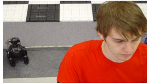
Figure 3. The AIBO Surrogate in the real world

The AIBO ERS 7 is a programmable robot dog produced by Sony. The AIBO Surrogate item communicates with and controls the robot using the Tekkotsu framework software [8]. The AIBO Surrogate was developed using CB plug-in capabilities [5], and has both an owner and an audience : the owner posts the item, all other users are the audience. This separation allows for the owner to be the one to communicate with the robot while the audience