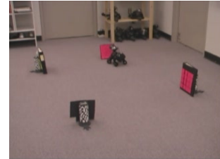
Figure 2. Patrolling around the markers and inspecting the door.

The AIBO patrols an area designated by four pink markers in a rectangular fashion. It can inspect objects (a door in this case) that are behind the set of markers (see Figure 2).