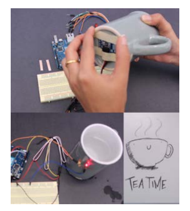
Figure 1: Temperature of a liquid can be measured by a temperature sensor attached to the bottom of a mug and notified via an LED. The same setup can also be used in a client-server example to notify a friend about tea time by interactive messaging.