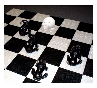
Fig. 1. Sheep and Wolves: the AIBO robotic wolves closing in on the mixed reality sheep

interactive qualities of major human-robot interaction applications. Our idea and solution is a collaborative board game involving humans and robots played in a shared physical environment. This setup serves as a test bed where various interfaces and robot behaviours can be developed to facilitate game play, and in turn, user evaluations can be performed to test their effectiveness.